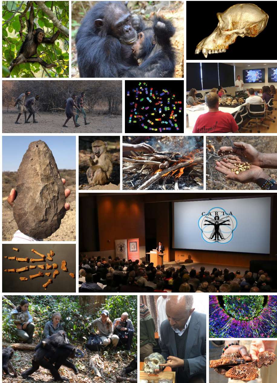
The images above represent a small sample of CARTA's programs.

To get involved, visit carta.anthropogeny.org/support